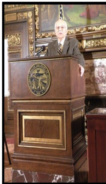
Photo: Former 35 th Governor Al Quie spoke about the history of Minnesotans in the Civil War, his family and their part

Photo: Minnesota Emancipation Proclamation Remembrance Day plaque.