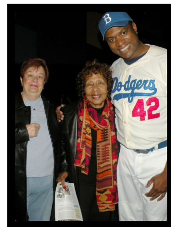
Movie "42"—theater event at Edina Southdale 16 and honored guests. (4/13/2013)