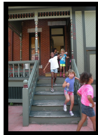
MAAM is for the children!